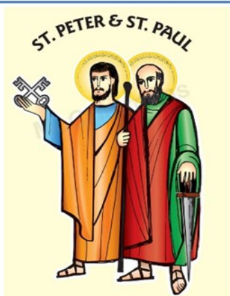
A prayer to Sts. Peter and Paul

THE WEEKLY JOURNAL OF ST. FRANCESCA CABRINI PRIMARY SCHOOL, HONOR OAK, LONDON